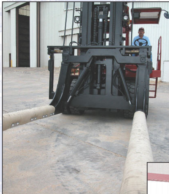
Independent side shift/swing fork carriage.

The TMHO Admiral Series' innovative offset operator station affords easy ingress/egress and maximum all-around visibility with the 3-stage mast. Left side narrow access available.